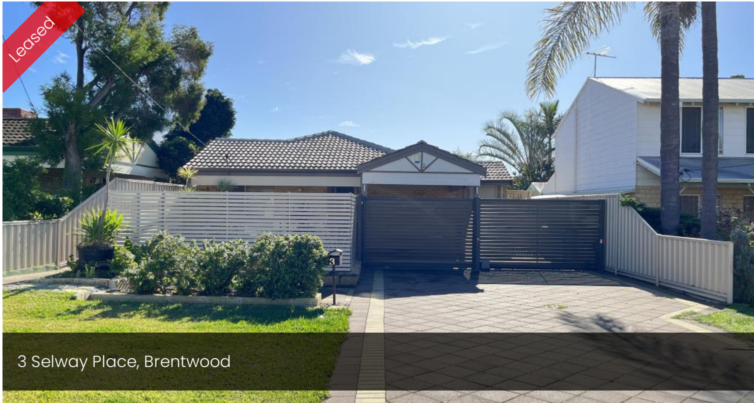
3 Selway Place, Brentwood