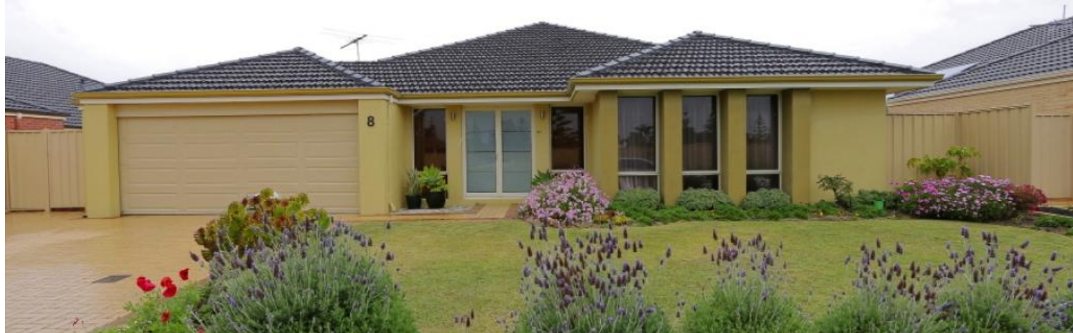
8 Urquhart Court, Canning Vale