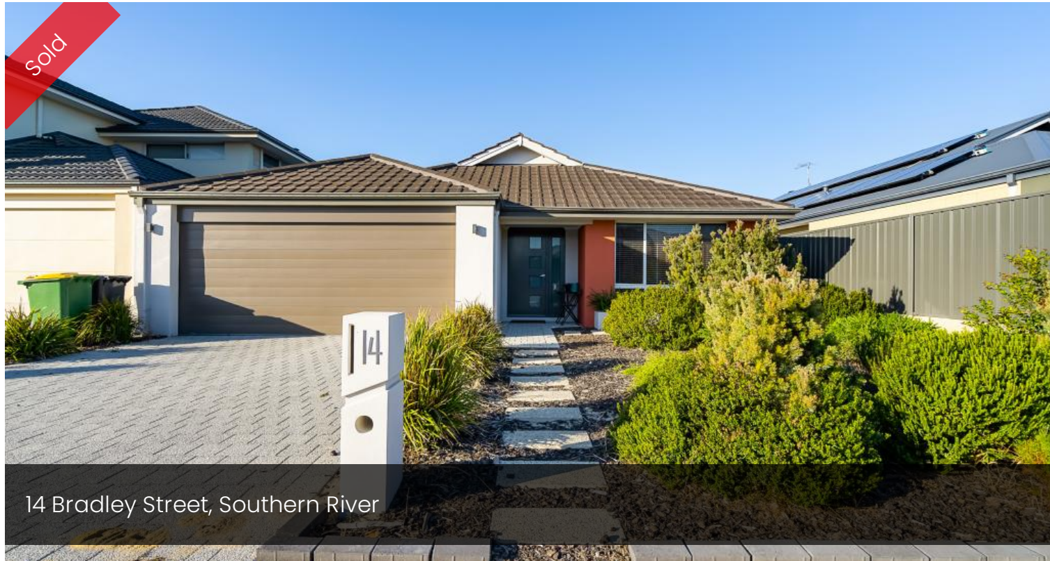
14 Bradley Street, Southern River