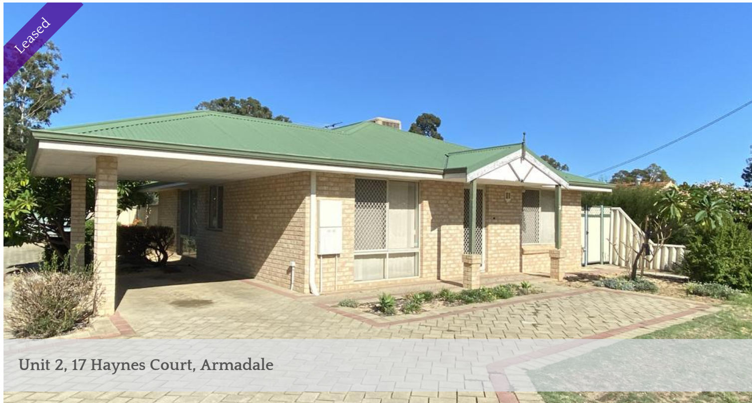
Unit 2, 17 Haynes Court, Armadale