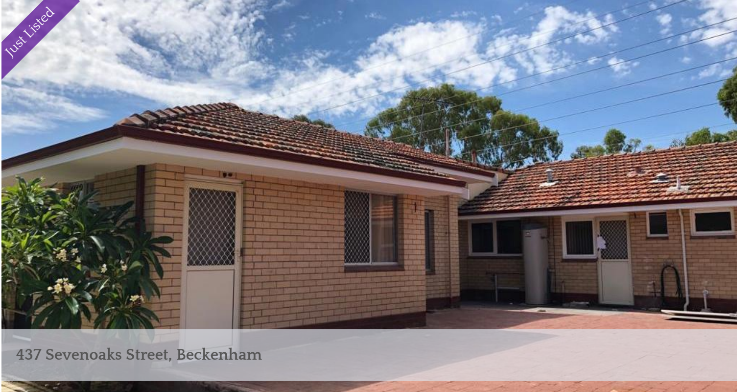
437 Sevenoaks Street, Beckenham