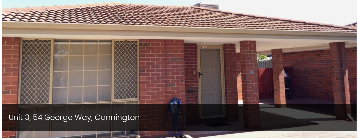
Unit 3, 54 George Way, Cannington