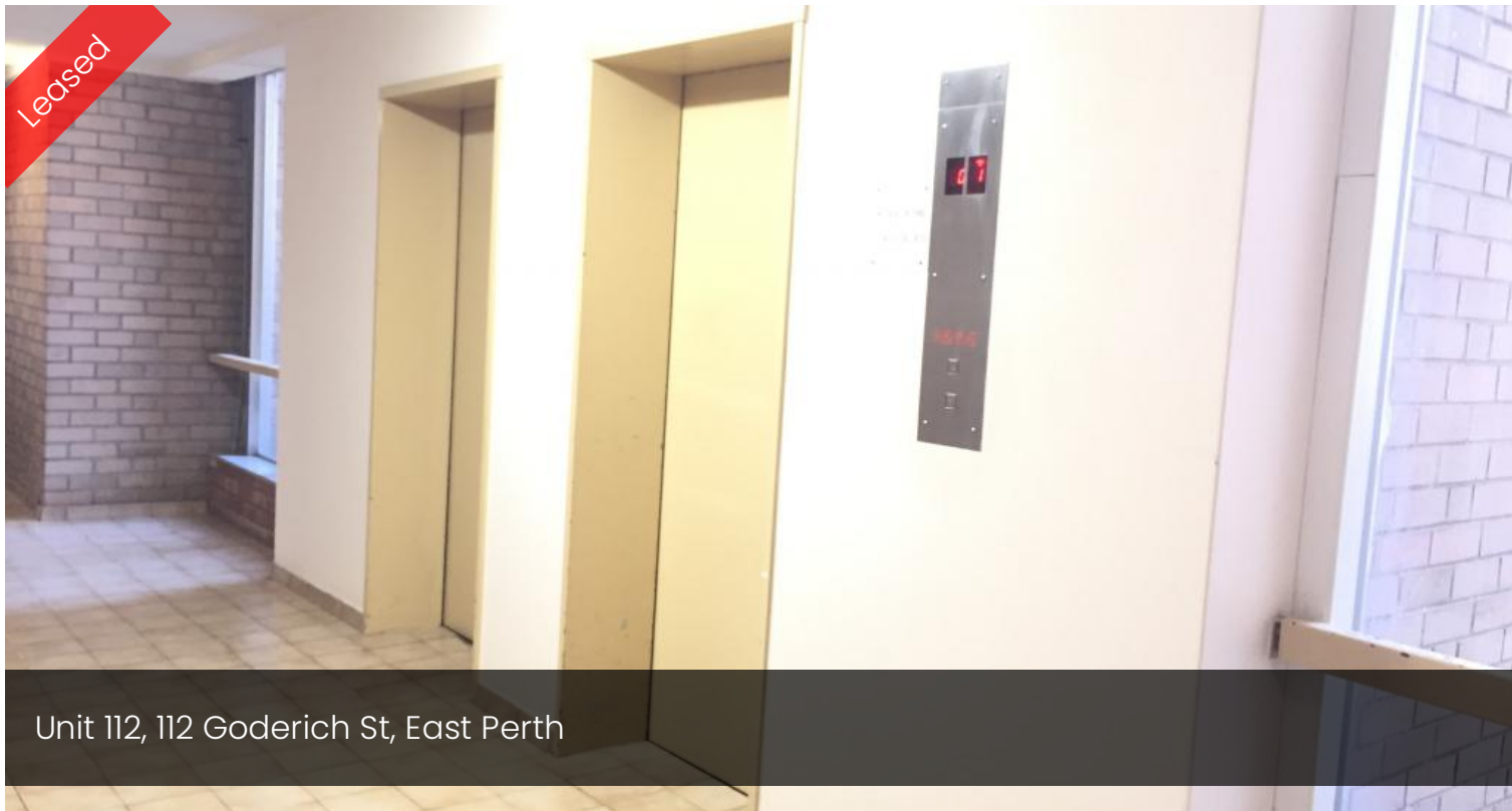
Unit 112, 112 Goderich St, East Perth